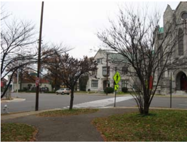
Northwest corner of Morris Park facing St. Mary's Cathedral