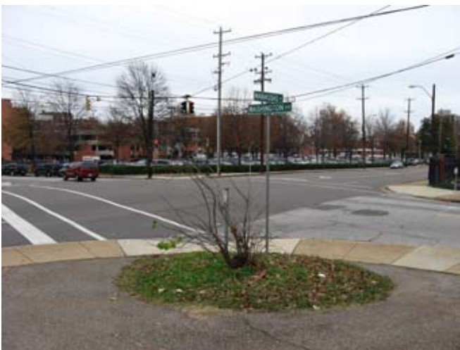
Southeast corner of Morris Park facing Le Bonheur Hospital