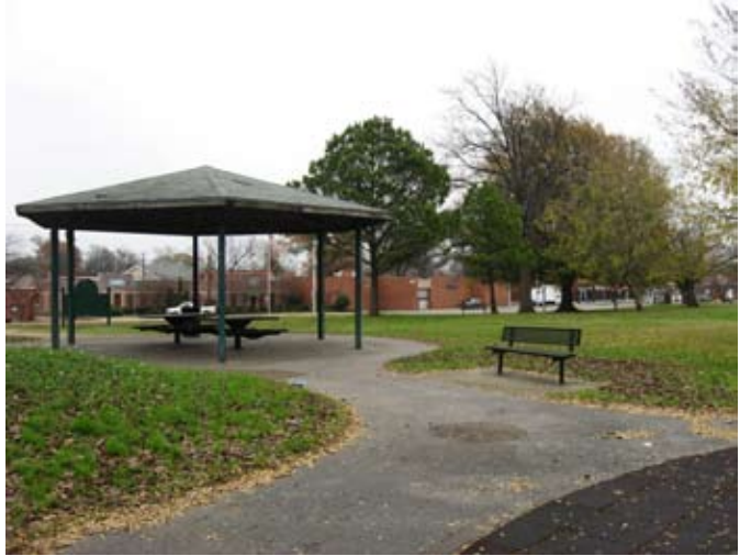
Morris Park – Pavilion in center of park