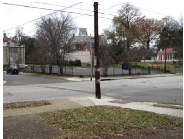
Southwest corner of Morris Park facing historic homes