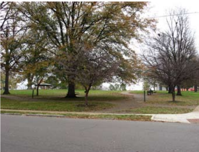
Morris Park – Southwest corner looking east