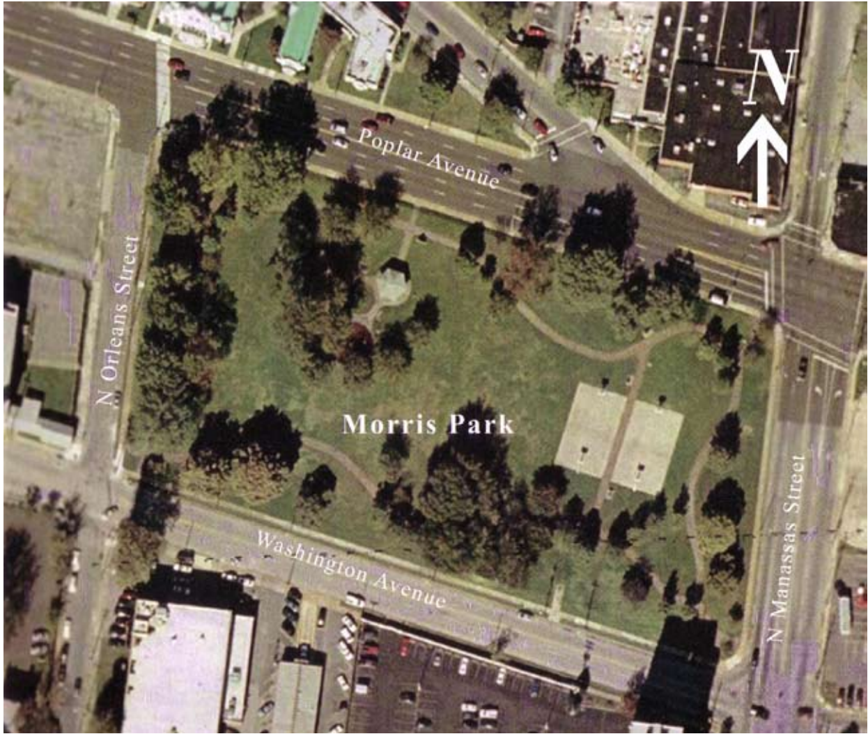
Detailed aerial view No scale indicated