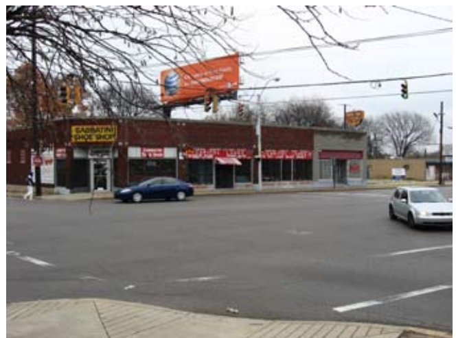
Northeast corner of Morris Park at Poplar and Manassas