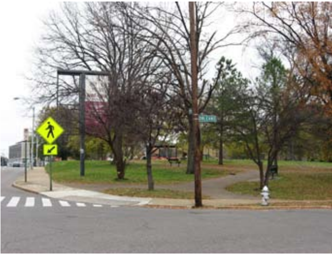
Morris Park – Northwest corner looking east