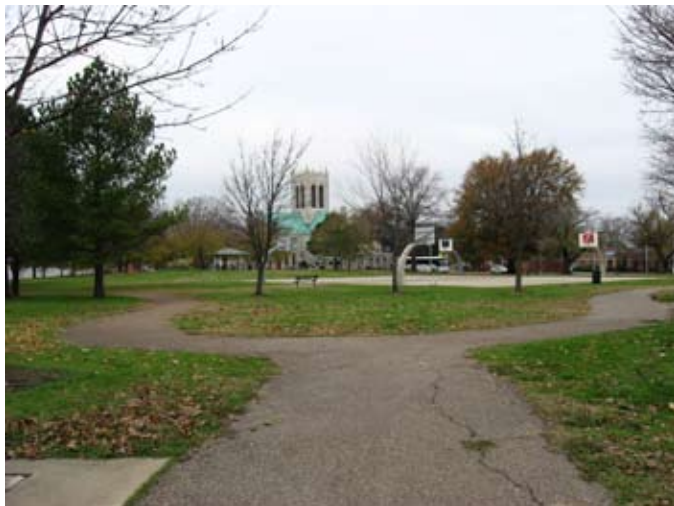
Morris Park – Longview from southeast corner